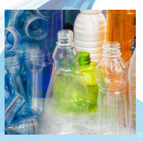
GUARANTEE OF RESULTS

In addition to having advantageous rates compared to manufacturers', we optimize machines by reducing production costs