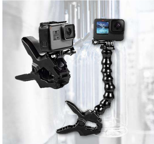
CLAMP WITH ADJUSTABLE NECK

A professional, waterproof camera with front LCD screen and touch screen, 5K Ultra HD video, and stabilization